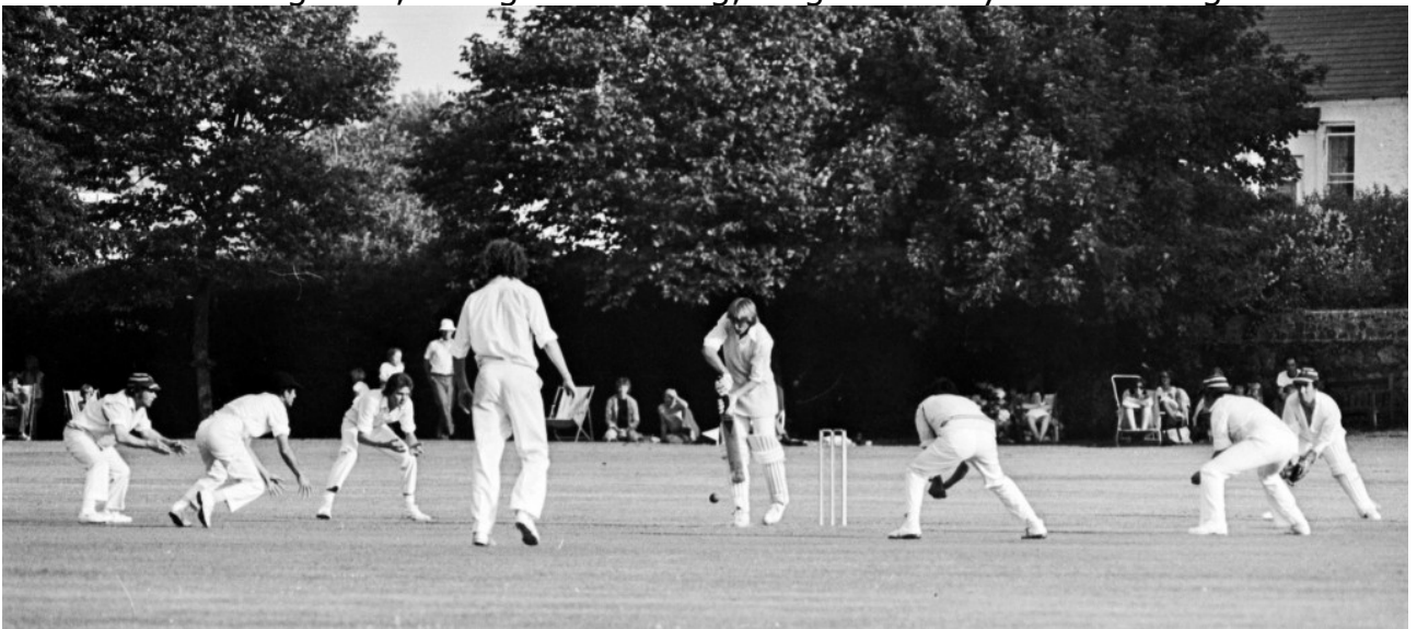
Guernsey gather round but could not prise out the last batsmen

From then on only two results seemed possible – a draw or a Guernsey win. The arrival of last man Middleton signalled the end of the run-chase for Jersey. With the superb bowling of Dobson and Le Cocq it was on the cards that, with four overs remaining, Guernsey would win. But credit to the last pair who survived an ultra-attacking field, and good bowling, to give Jersey a nail-biting draw.